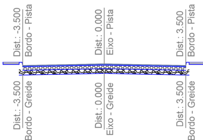
Figura 2 – Seção Padrão - Localização dos Pontos – Estacas 4 - 16